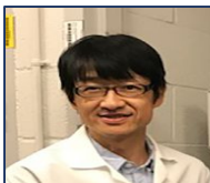
MP3 COVID-19 Awardee