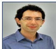
MP3 COVID-19 Awardee