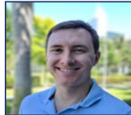
MP3 Faculty Startup Package Awardee