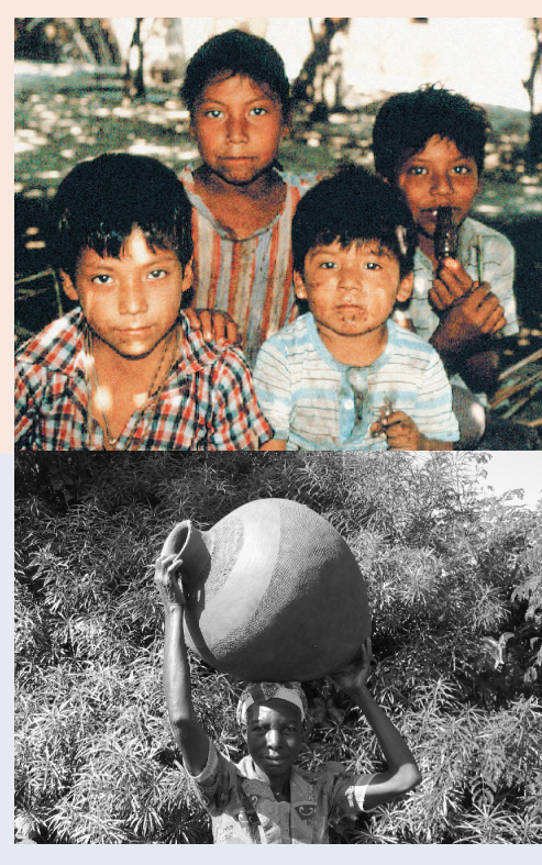
An estimated 1.1 billion people lack access to safe drinking water. Public health faculty are working to reduce this staggering figure.

Recognizing that tiny amounts of money may yield huge payoffs, faculty in the school of public health have worked to fight micronutrient malnutrition in children and pregnant women in countries in Central America and elsewhere.