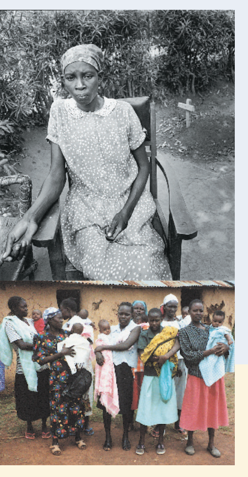
Researchers in nursing are working on a study in Kenya to help mothers prevent transmission of HIV to their children.

Motherhood is often abbreviated in Kenya, where about 20% of children die before the age of 5.